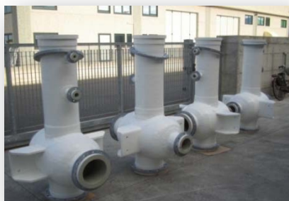
DEGASSINGS in PP+FRP