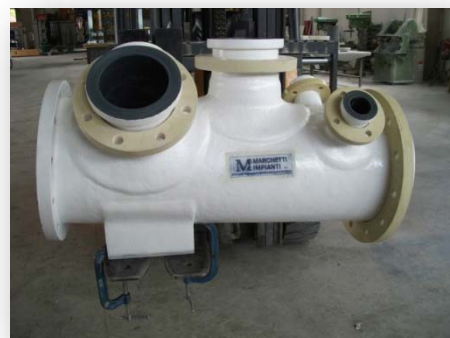
SPECIAL PIPE in FRP COCLEA