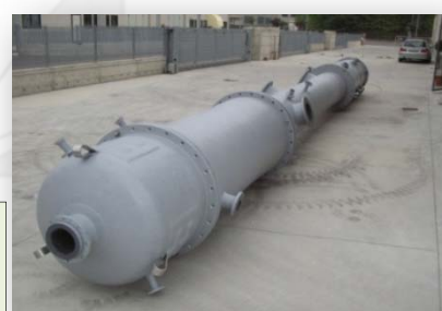
ACID TOWER Ø 800/600 in PVC-C+FRP