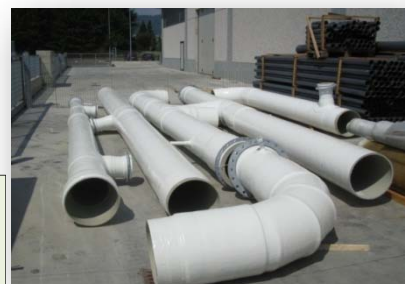
PIPINGS Ø 600/500 in PP+FRP