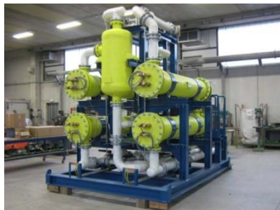
SKID ELECTROCLORINATOR UNIT