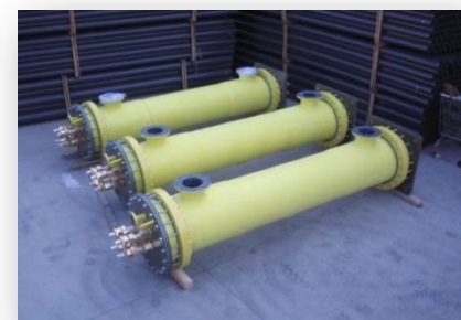
BODIES Ø600 in PVC+FRP