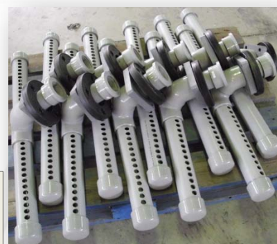
BRINE DISTRIBUTORS in PVC-C