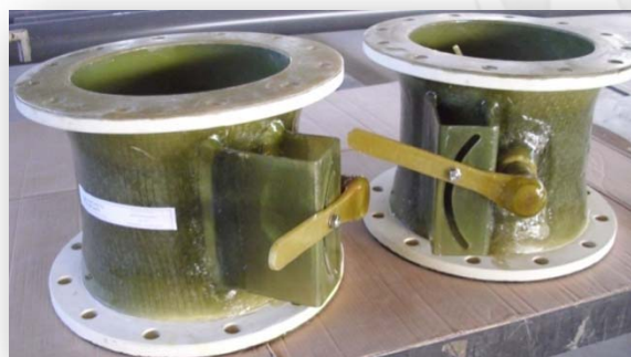
FRP BUTTERFLY AIR LOCKS Ø 350 in FRP