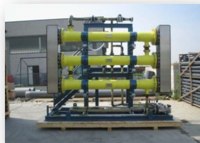
GENERATOR SKID ELECTROCLORINATOR UNITS