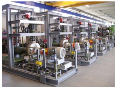
ELECTROLYTIC SYSTEM PUMPS SKID