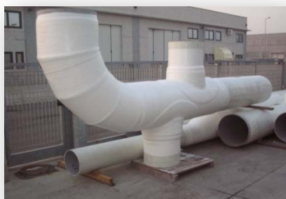
PIPINGS Ø 600/500 in PP+FRP