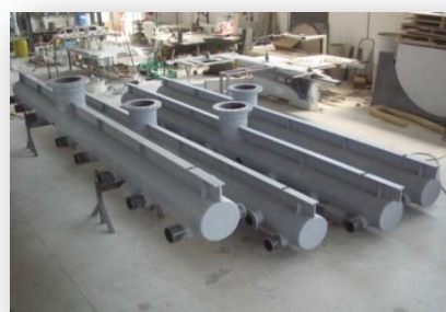
MANIFOLDES Ø 400 in PVC+FRP