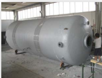
VERTICAL TANK in PVC + FRP Ø 2500 h. 7200.