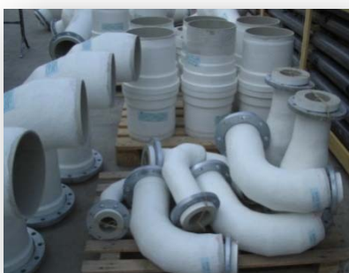
PIPINGS e FITTINGS in PVC-C