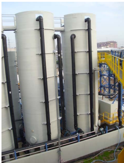
VERTICAL TANKS Ø 2500 H. 10000 in PVC+FRP