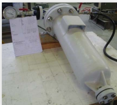
FILTER in PVDF+FRP Ø 160