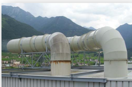
FUMES EXPULSION CHIMNEYS Ø 1500 in PP ZINC SYSTEM