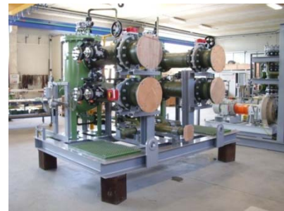
FILTERED SKID ELECTROCLORINATOR UNIT