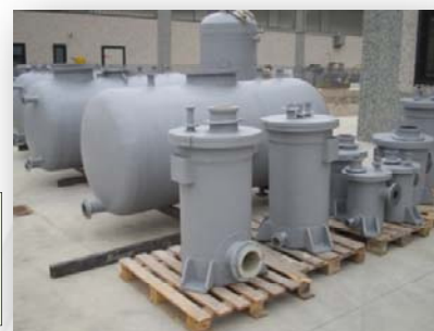
VARIOUS Ø TANKS e HYDRAULIC GUARDS in PVC+FRP