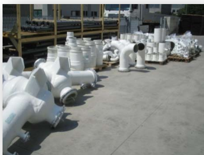
SPOOLS e FITTINGS in PP+FRP