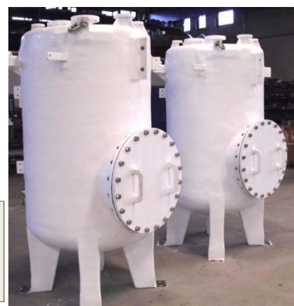
VERTICAL TANKS FARM HYPOCHLORITE SODIUM Ø 1000 in FRP