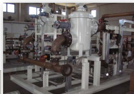
FILTERED SKID SEA WATER