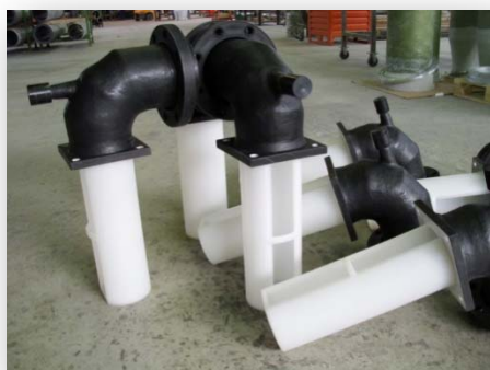
DISTRIBUTORS PIPES Ø 160 in PVDF+FRP