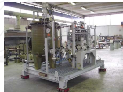
DOSING SKID HYPOCHLORITE SODIUM