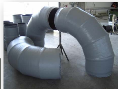
ELBOW 90° Ø 600 in PVC+FRP