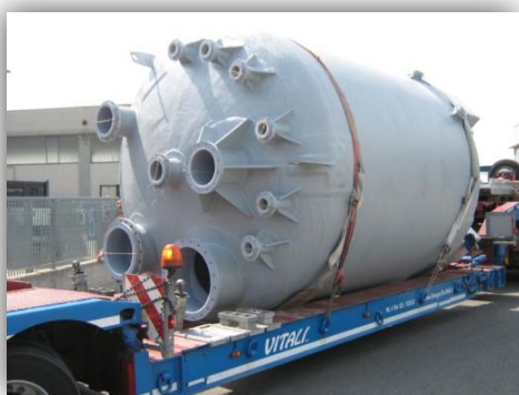
VERTICAL TANKS in PVDF Ø 3000 h. 5200