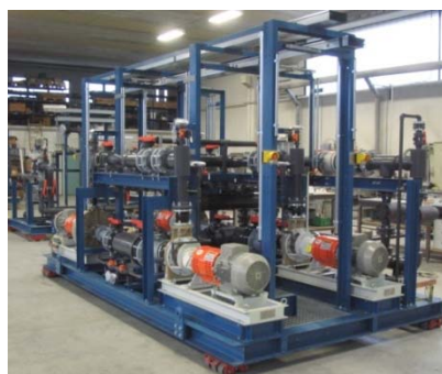
ELECTROLYTIC SISTEM PUMPS SKID